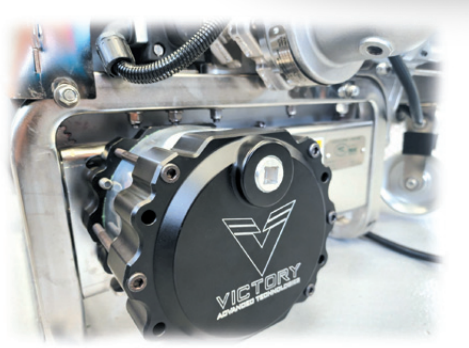
– space for more copy –