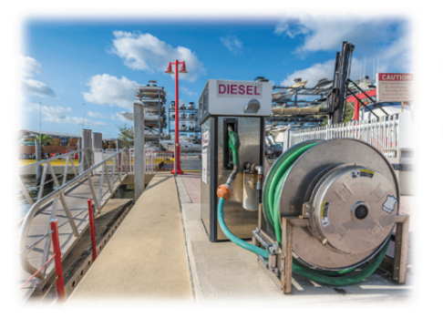
- space for more copy -